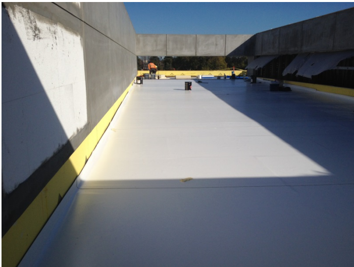
Date:02/03/16 Roofing membrane applied over courtyard area between mechanical well and adult high roof.