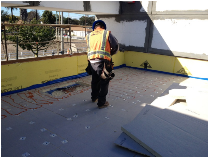
Date: 02/02/16 JP Witherow spreading adhesive prior to installing second layer of insulation for roofing system.