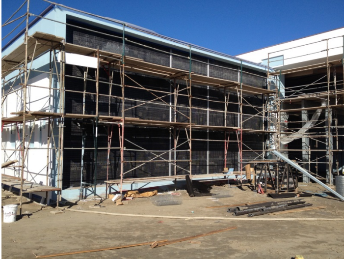
Date: 02/01/16 Building paper and metal lath installed at South bubble wall adjacent to entrance to the Library.