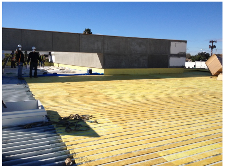
Date: 02/02/16 WCF installing insulation in between flutes of deck over the teen area.