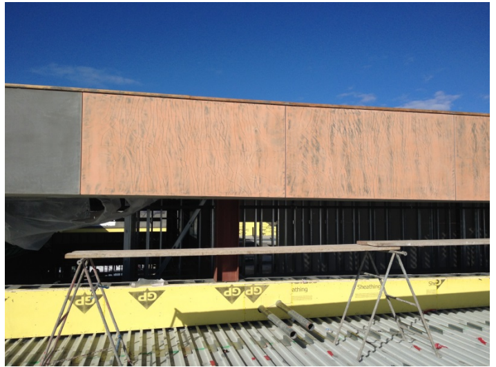
Date: 02/02/16 Rutherford applied Skim-it coat to EIFS in preparation for final coat application.