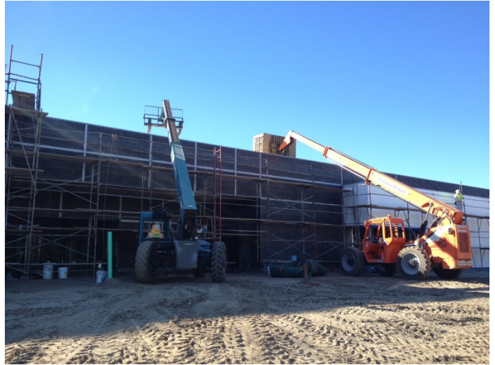
Date: 02/01/16 JP Witherow loading roofing material onto roof in preparation for start of work.