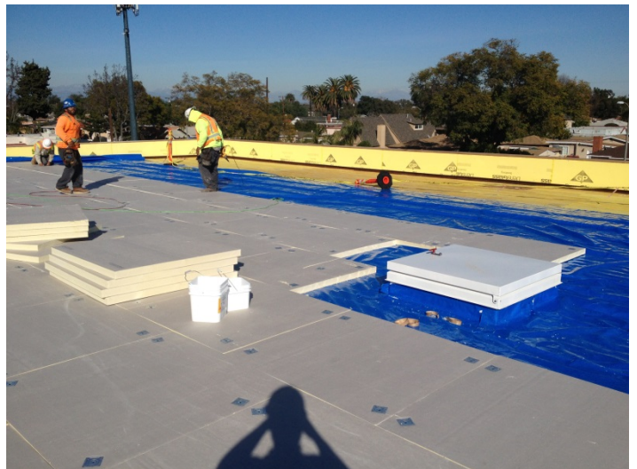
Date: 02/03/16 JP Witherow continuing with roof installation over teen area.