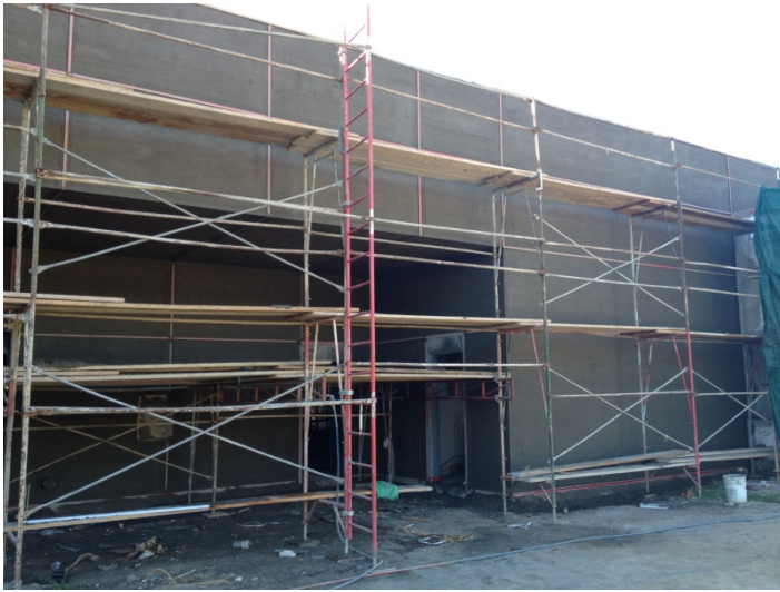
Date: 02/10/16 Applied plaster scratch coat at East face of the building, exterior of book drop off location.