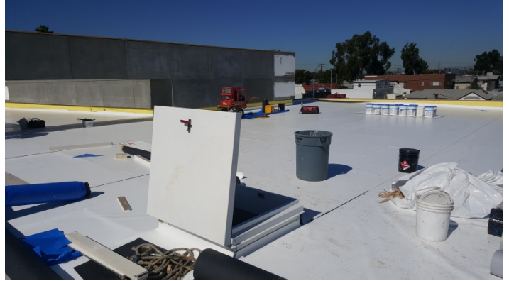
Date: 02/08/16 Installed roofing membrane above teen section of the Library.