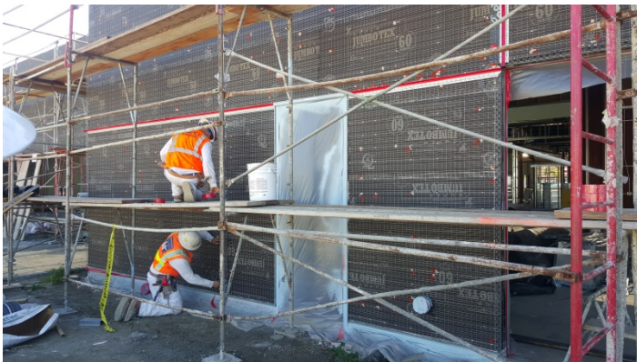
Date: 02/08/16 Rutherford taping reveal joints in preparation for scratch coat application.