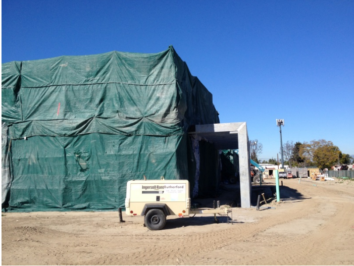
Date: 02/09/16 EIFS crew covering South end of library in preparation for rasping of installed foam board.