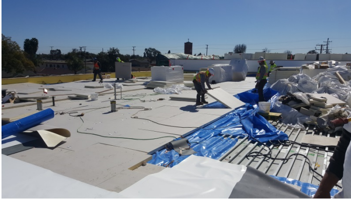
Date: 02/08/16 JP Witherow continuing with roofing installation at main roof on East section of building from teen section to classroom.