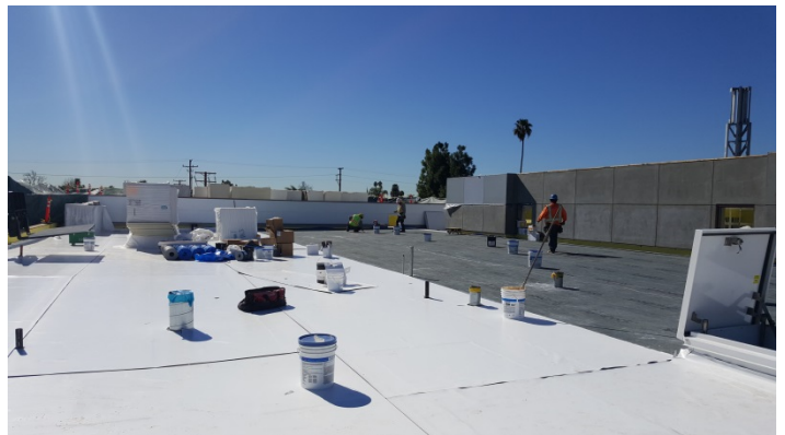
Date: 02/09/16 Progress of roofing installation on East half of library, from teen section extending to classroom.