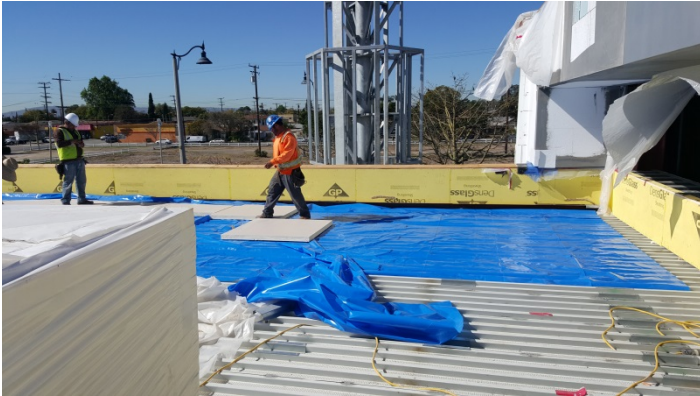
Date: 02/09/16 JP Witherow continuing with roofing installation at South end, above children's section / main restroom location.