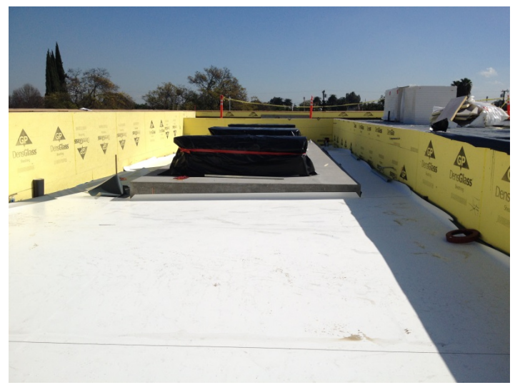
Date:02/19/16 Roofing installation at mechanical area adjacent to community room.