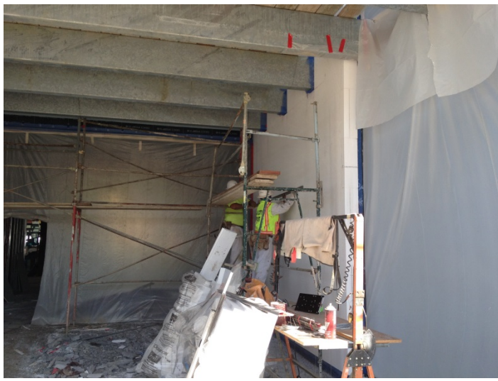
Date: 02/19/16 EIFS crew rasping and detailing EIFS at entrance to the Library.