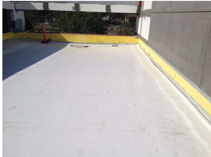
Date: 02/19/16 Previously installed flat bars at base of walls in courtyard area.