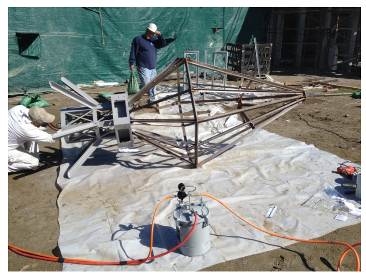
Date: 02/19/16 Painters priming tower spire in preparation for painting and hoisting onto structure.