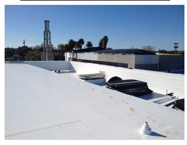
Date: 03/08/16 Progress of roofing installation at Mechanical Area I, above childrens collection area,