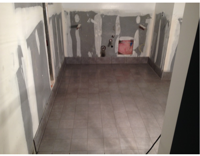
Date: 03/11/16 Tiling installed in staff restrooms.