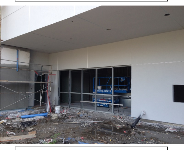
Date: 03/09/16 Curtain wall framing installation at classroom area, alongside East elevation adjacent to exterior book drop.