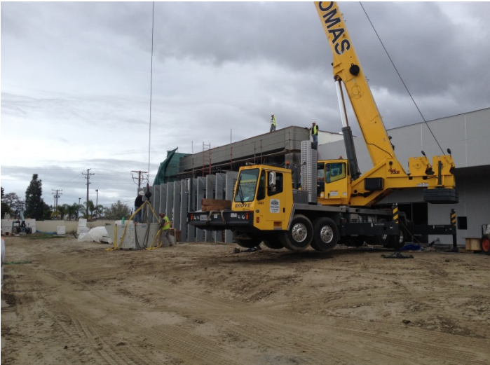
Date: 03/11/16 AC unit being prepped for lift and placement onto Mechanical Area II.