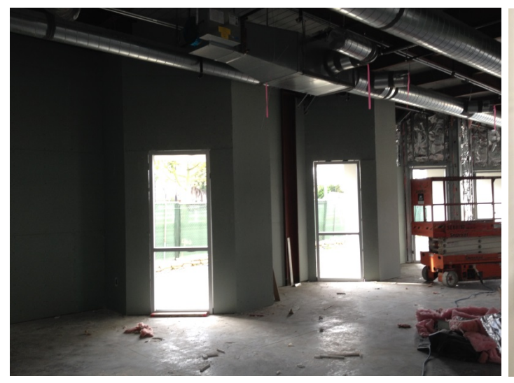
Date: 03/09/16 Drywall being installed along West elevation of Adult Collection Area.