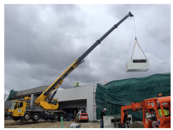
Date: 03/11/16 60 Ton AC unit being hoisted and lifted for placement onto roof.