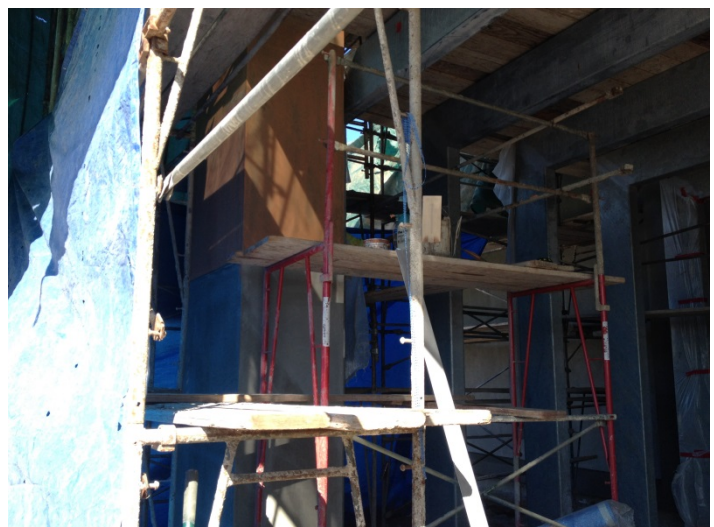
Date: 03/25/16 Column at entrance to Library with skim it product being applied in preparation for final finish.