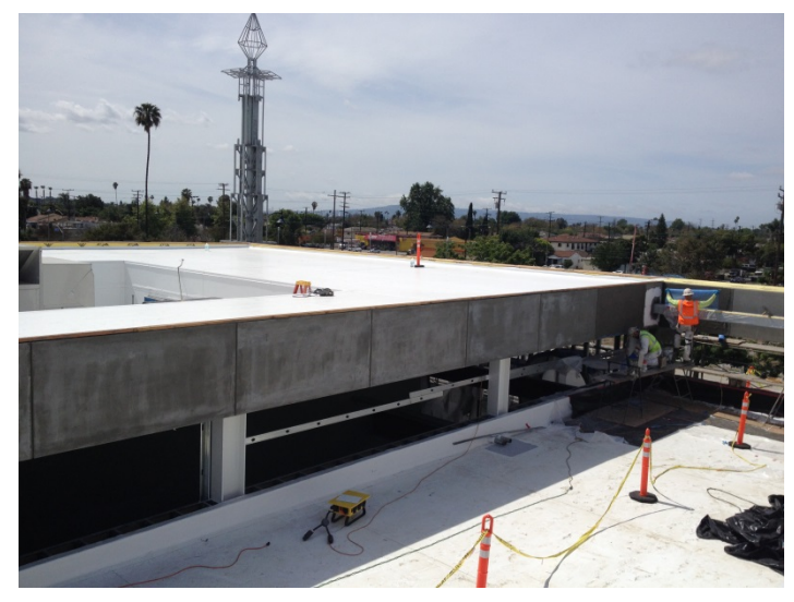
Date: 03/21/16 Mechanical I sarnafil adhered roof and Rutherford installing standard mesh and genesis DM at bridge.