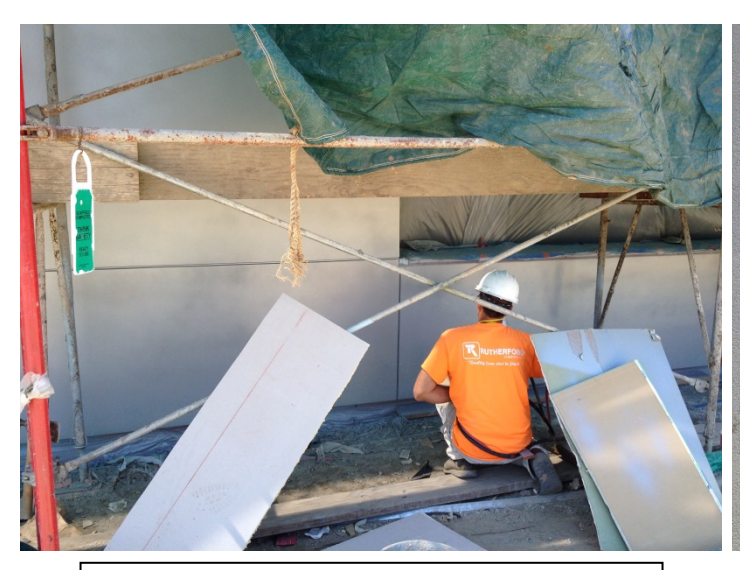
Date: 03/24/16 Rutherford spraying final metallic finish to EIFS located at East elevation, at the Family Learning Center.