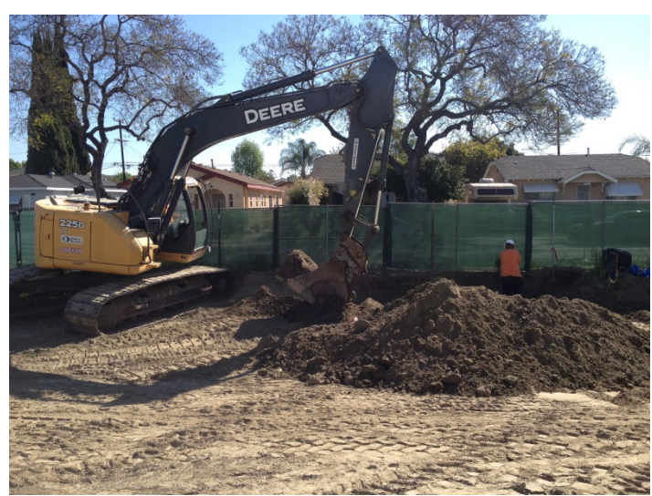
Date: 03/25/16 WCF excavating for site wall footings along the East end of the project site.