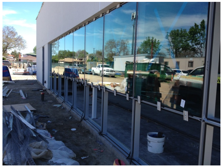
Date: 03/21/16 JP Witherow beginning to roof area above glazing at tower.