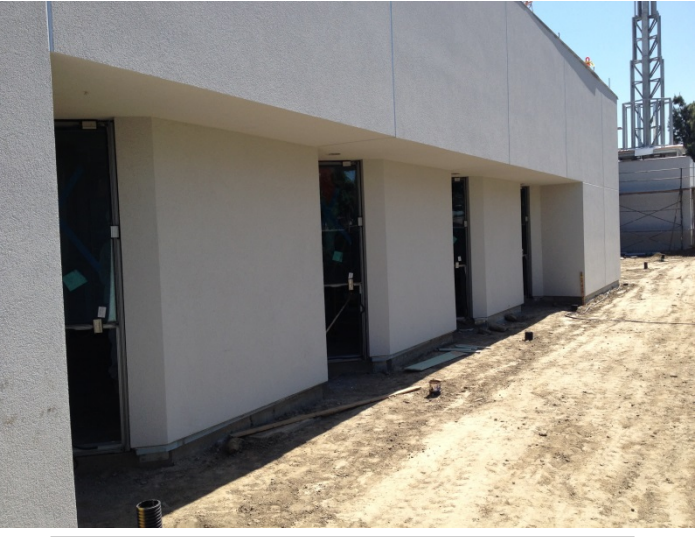
Date: 03/24/16 Glazing installed along West elevation at Adult Collection Area.