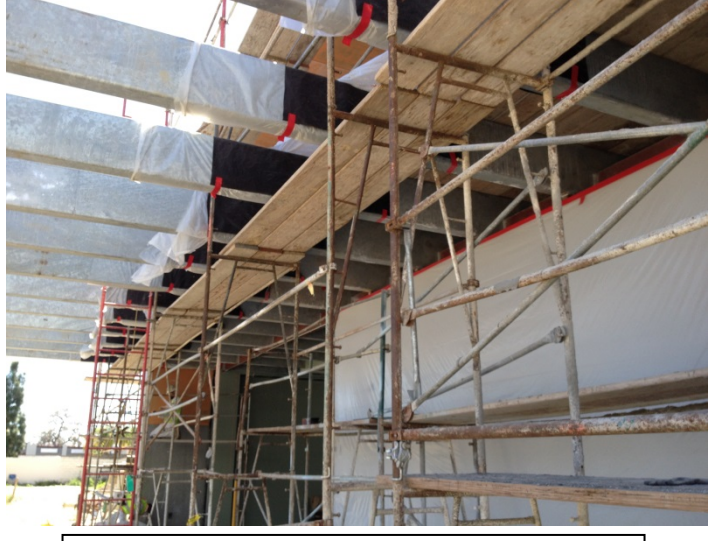
Date: 03/23/16 Rutherford beginning to apply skim-it coating at soffit beneath community patio / community meeting room.