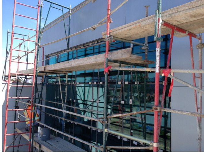
Date: 04/21/16 TMG caulking exterior joints at North curtain wall located at periodicals section.