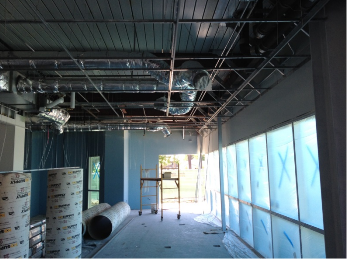
Date: 04/18/16 Progress of t-bar installation for metal ceiling at adult collection area.