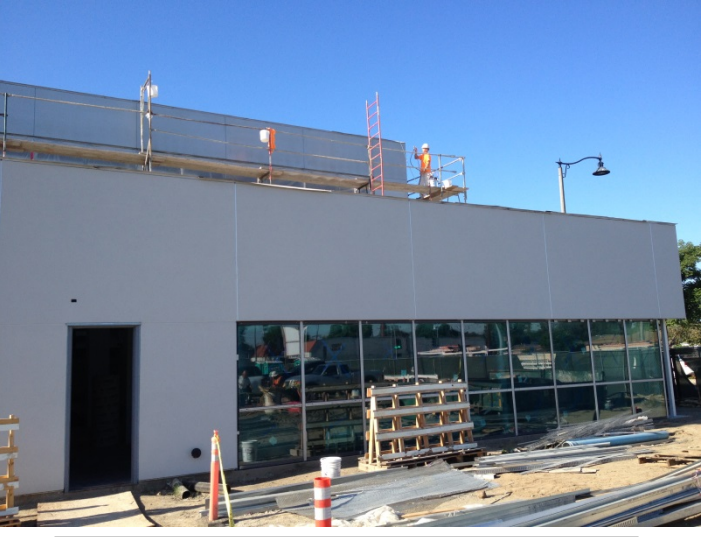
Date: 04/20/16 Rutherford applying final Reflect-it coat to EIFS panels on the upper North elevation.