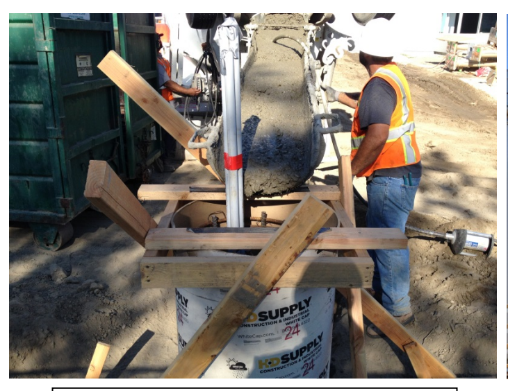
Date: 04/20/16 WCF onsite pouring concrete for light pole bases.