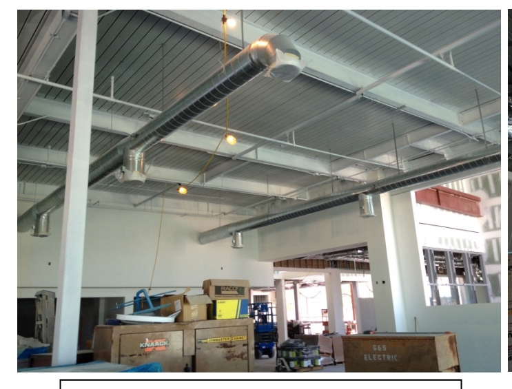
Date: 04/18/16 Quad County priming exposed beams in teen collection area.