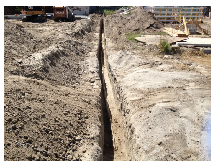
Date: 04/21/16 Gas line trench excavation and installation from retail space at the South end of the site.