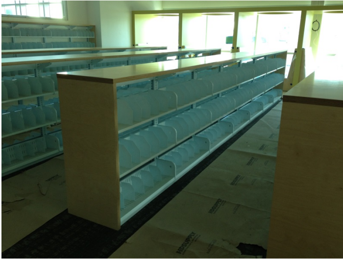
Date: 06/20/16 End and top wood panels installed at shelving in teen area.