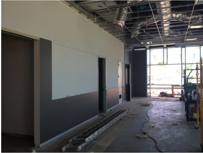
Date: 06/23/16 Progress of painted walls in the large community room.