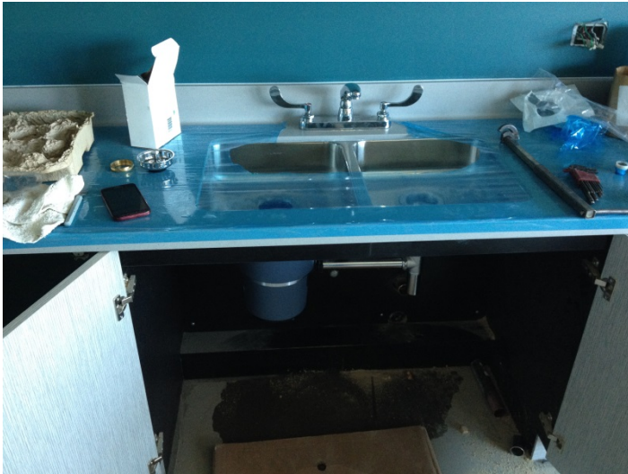
Date: 06/20/16 Plumbers installing fixtures and accessories at staff lounge sink.