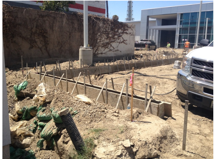
Date: 06/23/16 Progress of curb layout at the South end of the site, North of the trash enclosure.