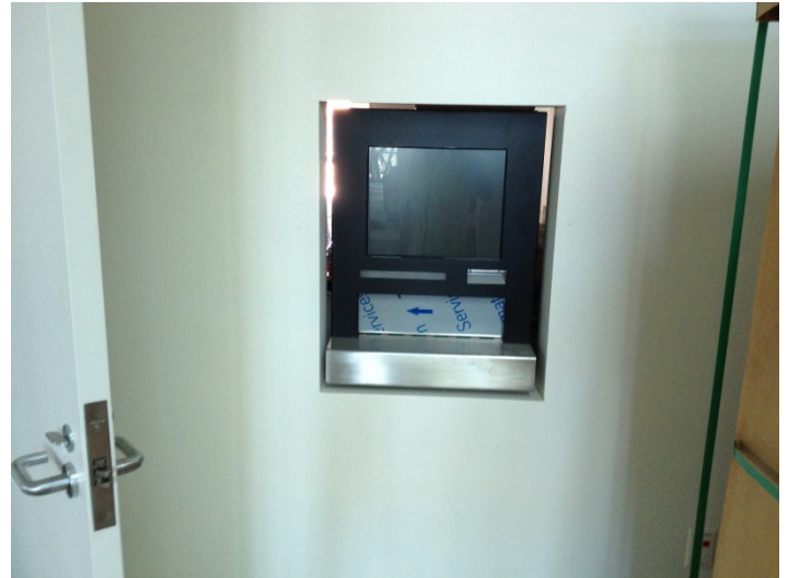
Date: 06/22/16 Book drop off equipment installed at interior location adjacent to main circulation desk.