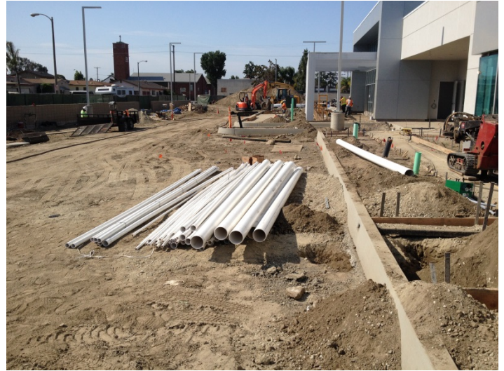
Date: 06/22/16 Landscapers onsite beginning excavation for installation of irrigation sleeves and piping.