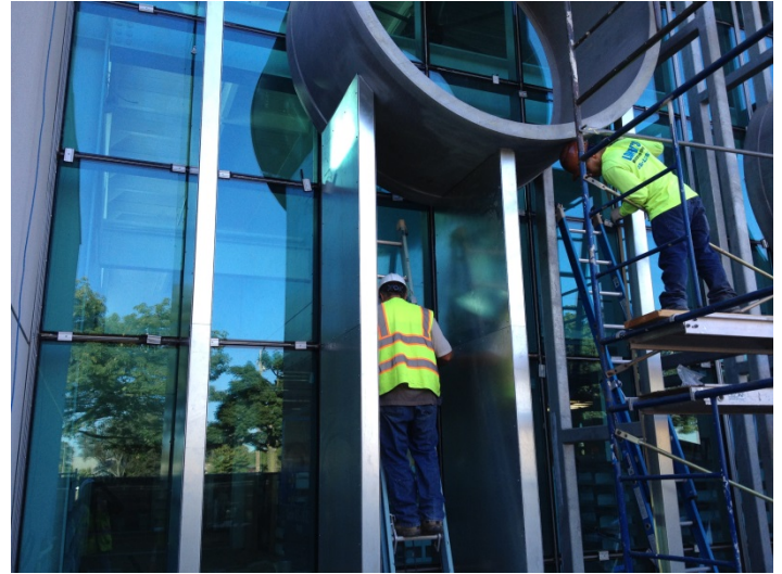
Date: 06/20/16 Sheet metal installation taking place at fin tube wall along the West elevation of the building.