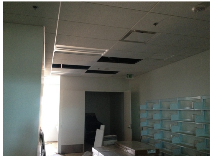
Date: 06/24/16 Progress of acoustic ceiling tile installation in the book drop off room.