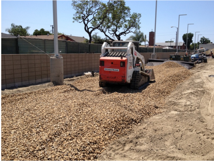
Date: 06/22/16 WCF spreading gravel for permeable pavement parking adjacent to Lime Avenue.