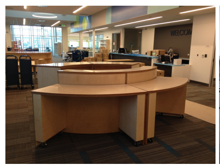
Date: 08/03/16 Additional book / media display millwork located at the main Library passageway.