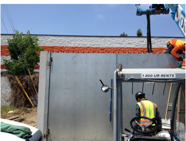
Date: 08/05/16 Bridge Iron onsite installing gate at trash enclosure.