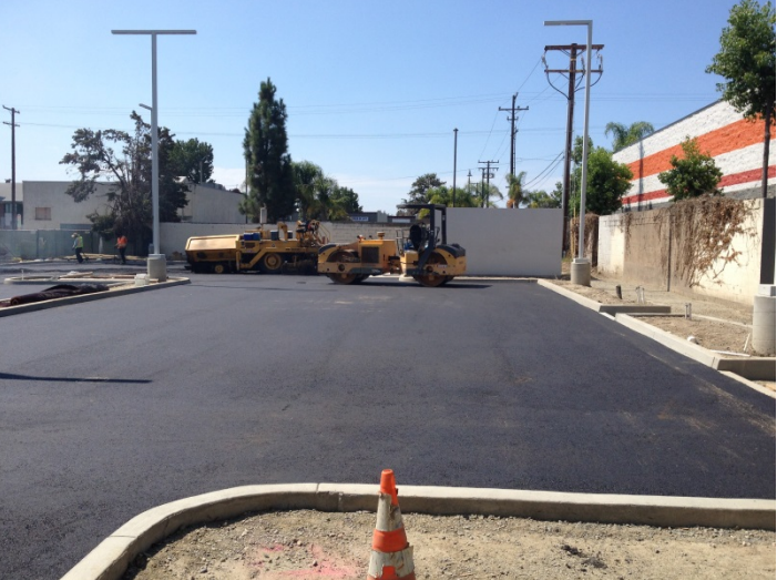
Date: 08/03/16 Progress of asphalt paving in the Southern parking lot area.