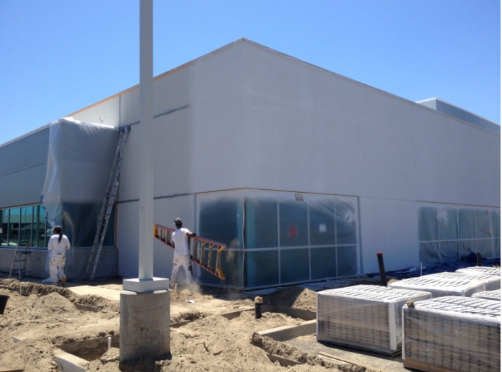
Date: 08/11/16 Progress of exterior plaster paint application at the Northeast corner of the building.