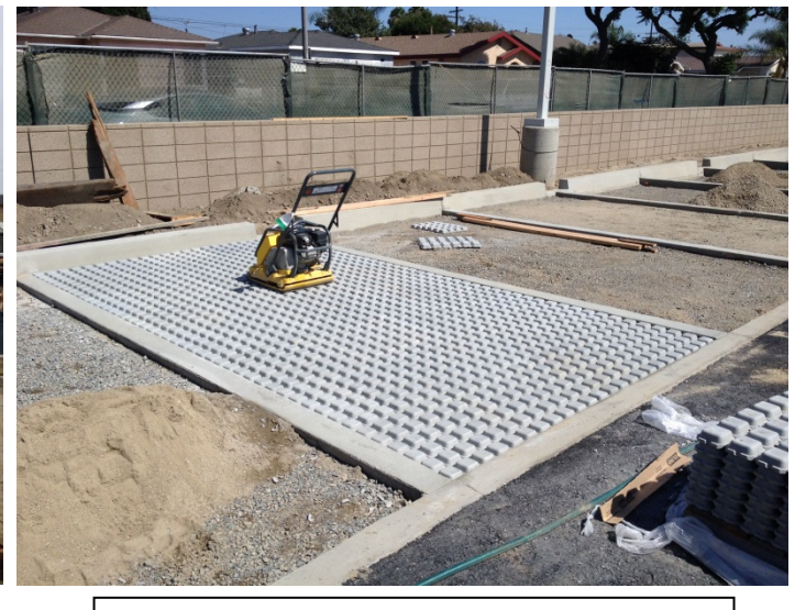
Date: 08/08/16 WCF installation of permeable pavement along the East end of the site.