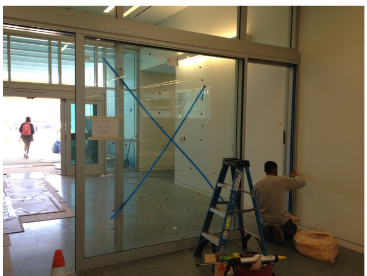
Date: 08/10/16 Glazer installing manual sliding door in Lobby area.