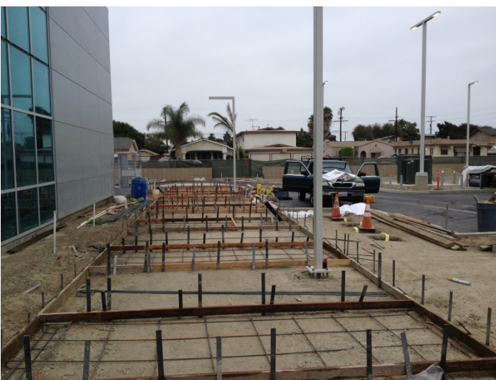
Date: 08/08/16 Site concrete subcontractor completing formwork and rebar installation for remaining paseo concrete.