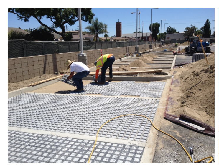
Date: 08/11/16 Progress of permeable pavement installation.