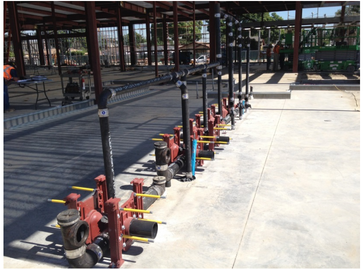
Date: 10/08/15 Rough in for plumbing at the main restrooms at the Southwest corner of the Library.