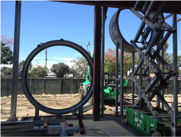
Date: 10/08/15 One of the "bubble" components looking West in the Children's collection area.