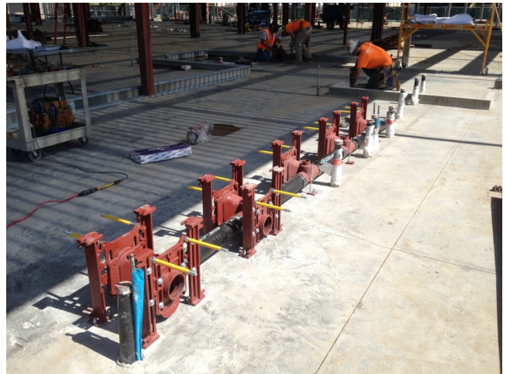
Date: 10/06/15 Installation of water carriers in the main restrooms at the Southwest corner of the building.