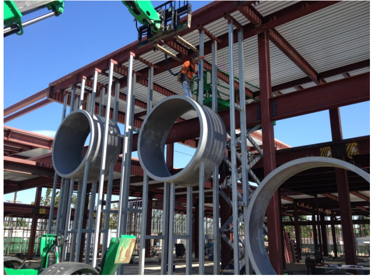
Date: 10/08/15 Bridge Iron erecting "Bubble" components into place at the Children's collection section.