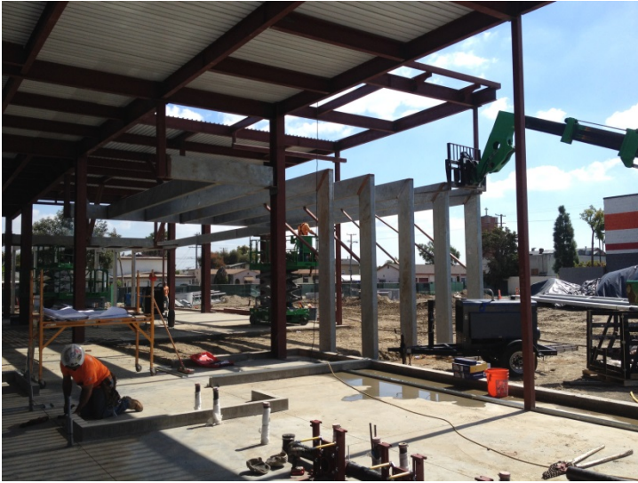
Date: 10/06/15 Bridge Iron erecting trellis over entrance to the Library at the South end of the site.