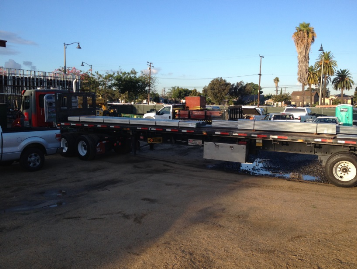
Date: 10/05/15 Rutherford receiving additional delivery of metal studs to the project site.