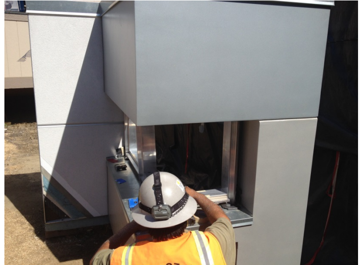
Glazing subcontractor onsite to finish mock up and install glazing.